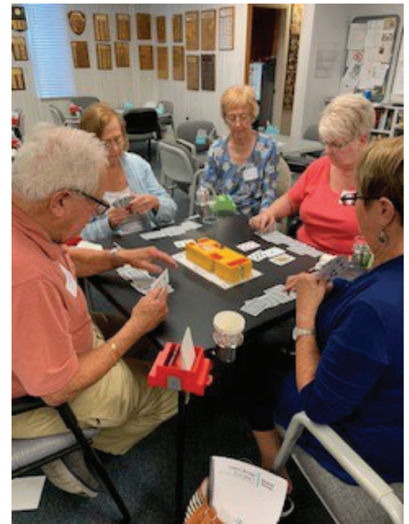
Each table of 5 at Hartford’s Learn Bridge in a Day event included four new players and one HBC “table helper.”

For more information about these and other HBC educational opportunities and special events, please visit our website or call the club at 860-953-3177.