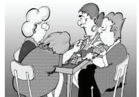
"Our bridge teacher says you're to make the opening lead face down!"